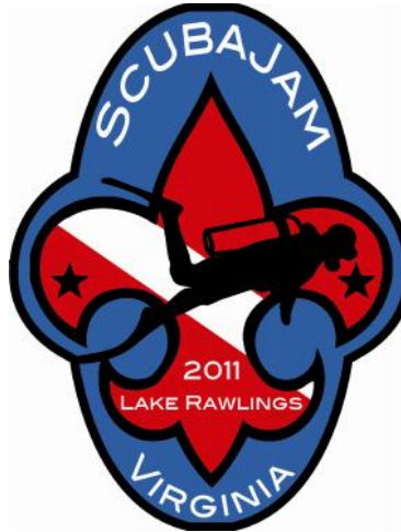
(ScubaJam 2011 Patch Design)